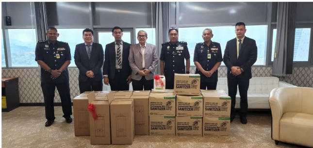
MEETING WITH ROYAL MALAYSIA POLICE FOR NEW HEALTHCARE CENTRE